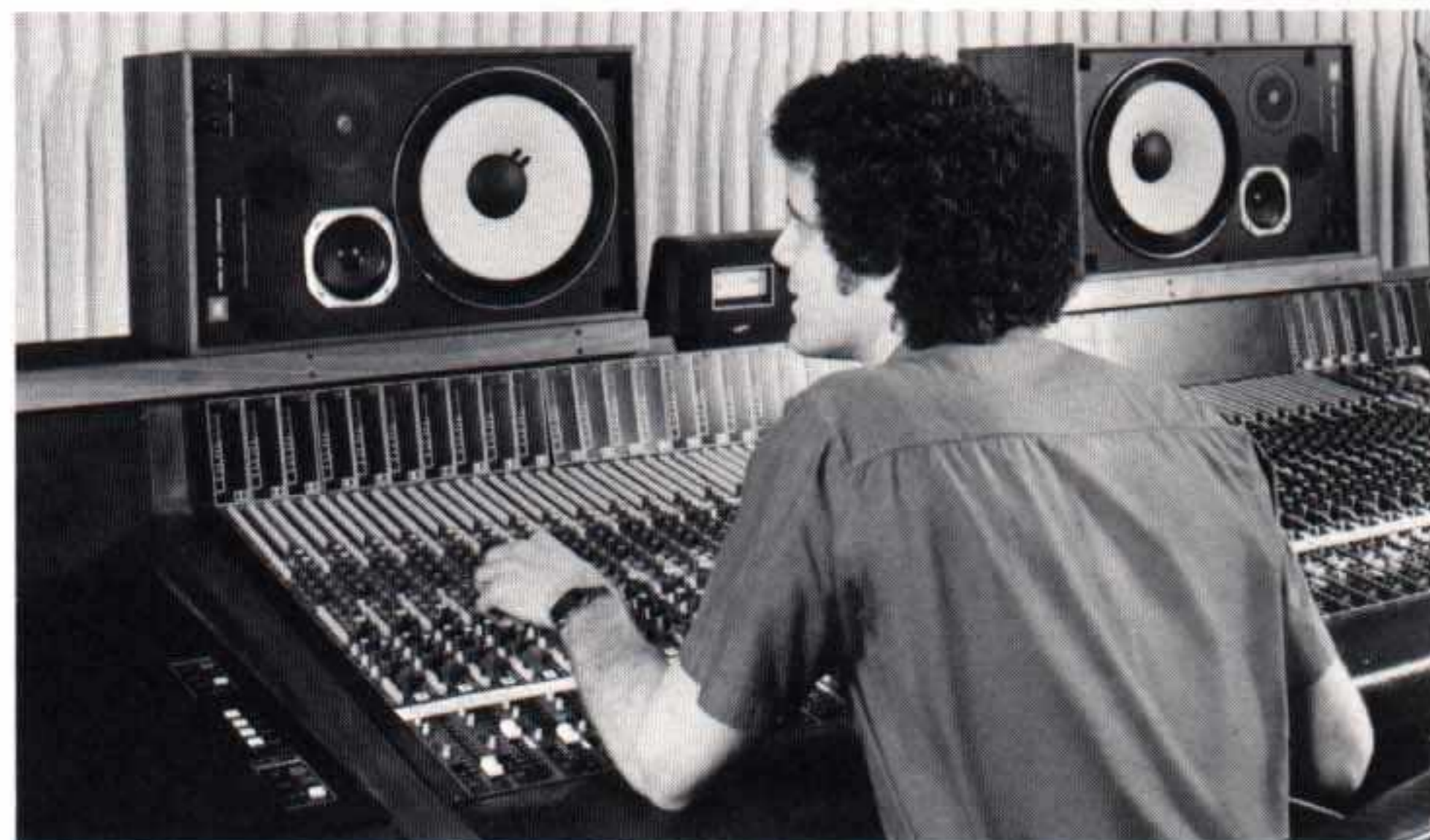
Photographed at Westlake Studio, Los Angeles, Calif.

One reason studios choose JBL (in addition to the good sound) is that JBL loudspeakers are simply built better. The attention to detail is obvious when you look at the oiled walnut